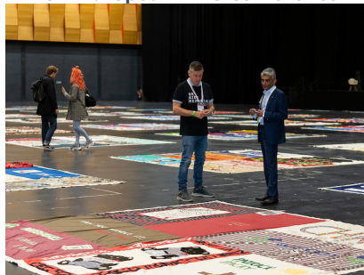
Anonymous quilt with message